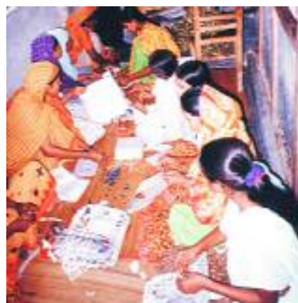
Handmade paper production cluster at Tongi

With these initiatives, JOBS expects the value of handmade paper exported from Bangladesh to reach US$5million in 2003.